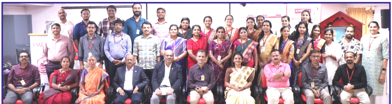
FDP Participants with Guests & Resource Persons - July 2025

What next after the July 2025 FDP? Implementation is the key Regular/ annual meetings to check the modified B Pharm Regulation and Curriculum; to check the PBL implementation; and to check the Assessments, MCQs and Question Banks implementation