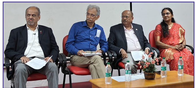
Release of FDP Manual