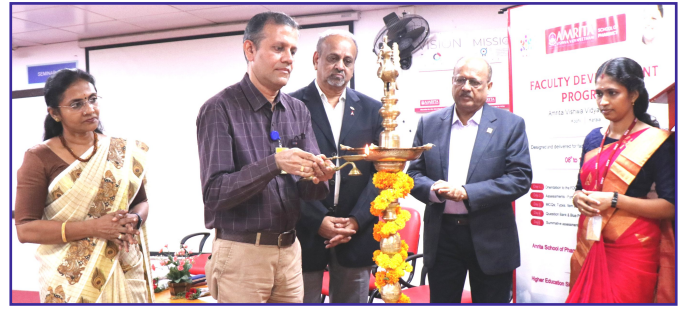
Lighting the Lamp