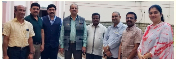
Meeting with JSSCPM Alumni after more than 25 years in Hyderabad