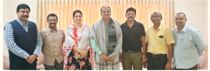
Meeting with JSSCP Alumni after more than 25 years

Luncheon meeting was very useful for me & alumni. The best gift for a teacher is when he meets his past students & alumni holding responsible professional roles & leading a happy life. I personally thank them all for honoring me & remembering me. I wish them all the best in their future endeavors.