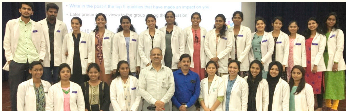
SACOP, BG Nagara, Pharm D 5th year students, Training on Leadership Skills 8th Nov. 2019