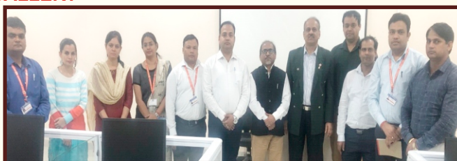
College of Pharmacy, SGT University, Gurugram, Haryana, 13th & 14th Nov. 2019 Digital Tools in Classroom