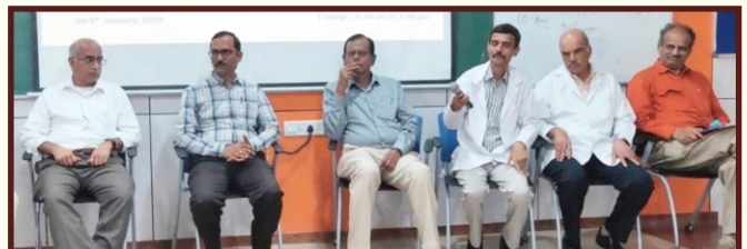
SACCOP, BG Nagar, 8th Jan. 2020, Panel discussion on Mgt of DM (Diabetes Mellitus)