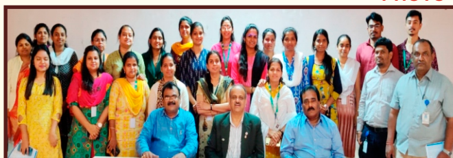
East West College of Pharmacy, Bengaluru, 11th Nov. 2019, training on Google, Zoom class & Kahoot App