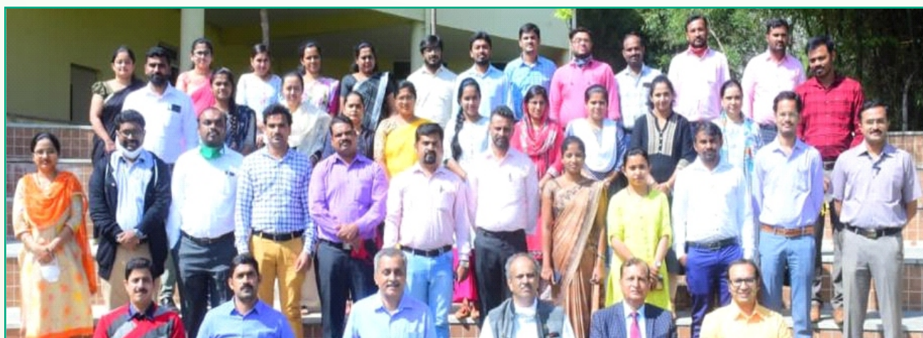
Faculty Development Program Participants, Adichunchanagiri University, BG Nagar, Karnataka 27 to 29 Nov. 2020

Knowledge is gained by reading, skill by practice, attitude is how to accept fact & apply. In this workshop we have learnt all the 3 beneficially