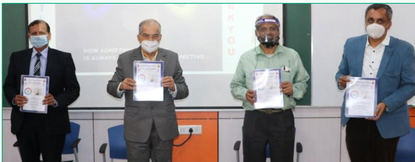
MOU was signed between ACU & HESDARC on 27 Nov. 2020