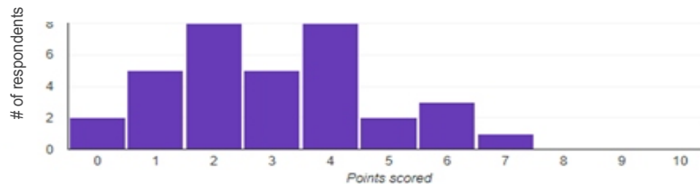
Total points distribution