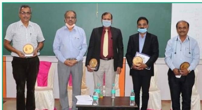
Panel Discussion - Panelists