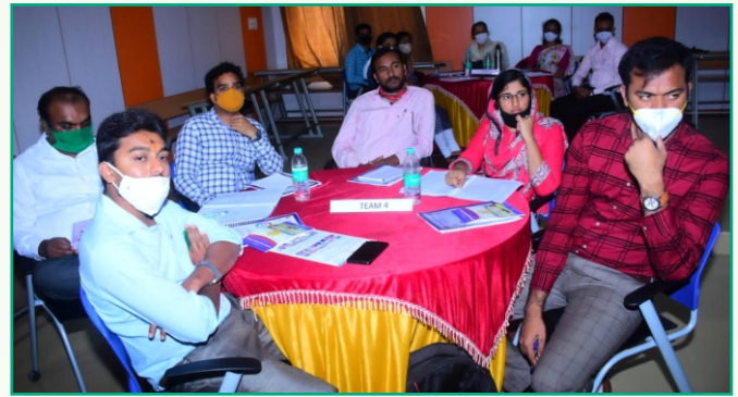
Participants at the workshop table